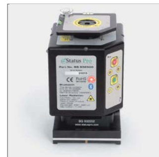
90° Adapter for T430 mounting (BG 832254) T430 Adapter for large L bracket Interface to BG 832254 (BG 832253)