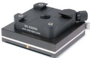
Switch Magnet Base for T430 Interface Plate BG_832251 (BG 832252)