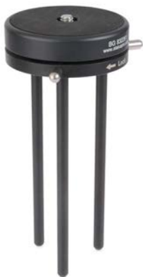
Short tripod extension (BG 832261)