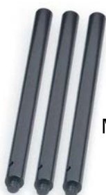
Mini Tripod Legs 200 mm (BG 832263)