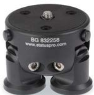
Tripod head for T430 (BG 832258)