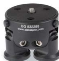
Tripod head for T430 (BG 832258)