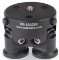
Tripod head for T430 (BG 832258)