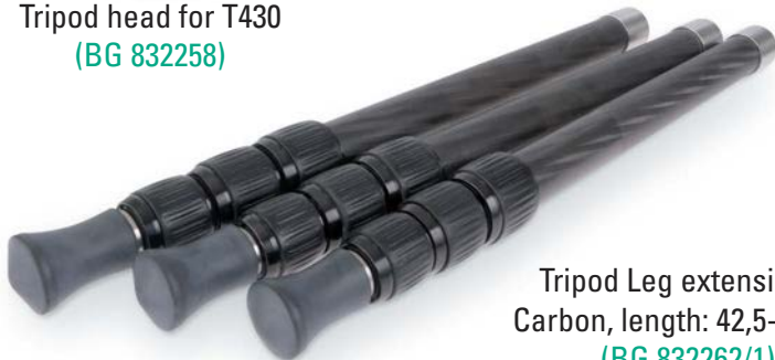
Tripod Leg extension in Carbon, length: 42,5-129 cm (BG 832262/1)