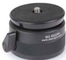
Tripod Gimbal head for T430 (BG 832260)