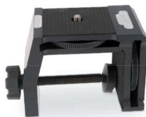
Universal G-Klump for T430 (BG 832255/1)